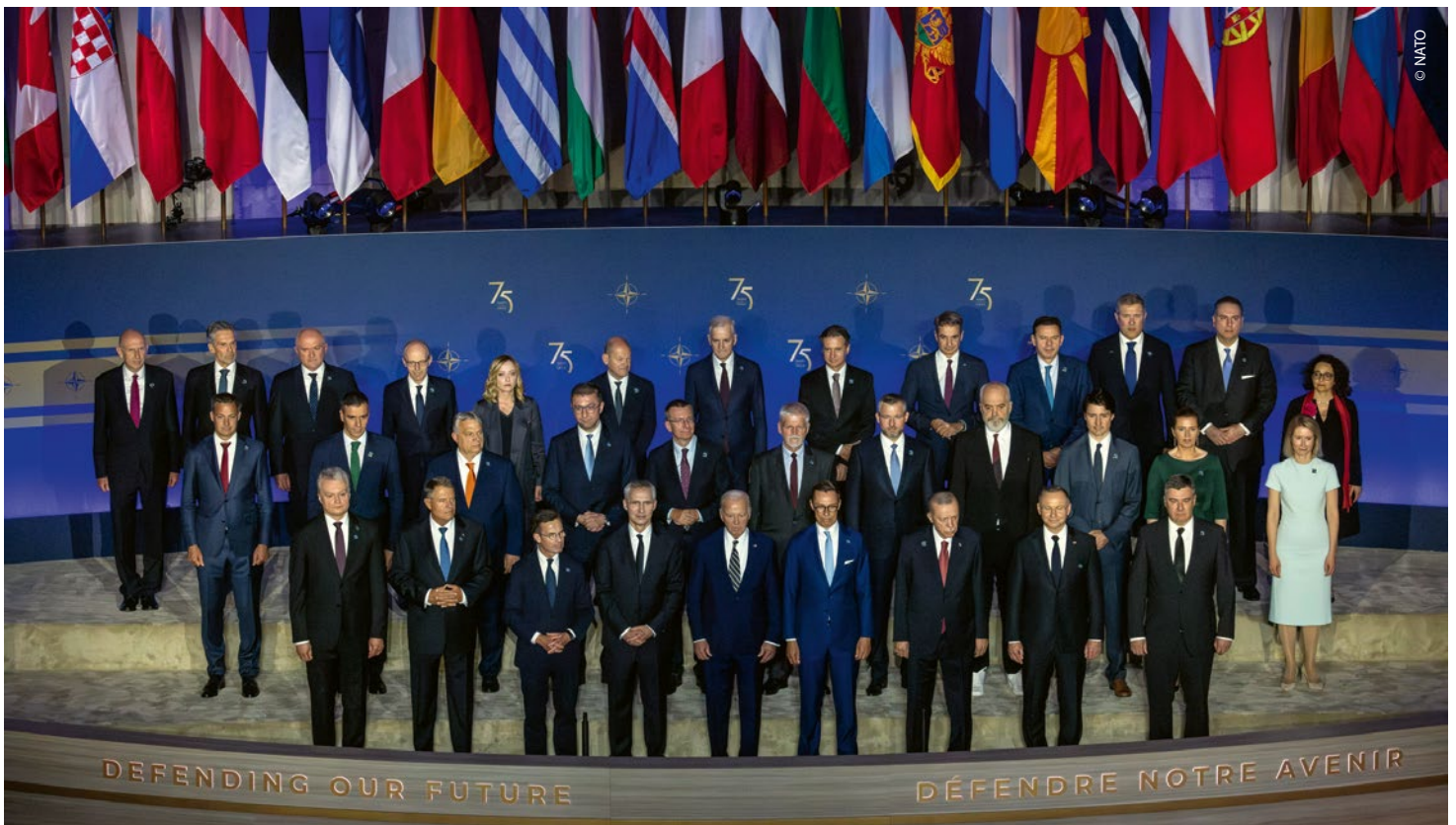
Heads of State meet for the NATO Summit in Washington D.C., 9–11 July 2024.