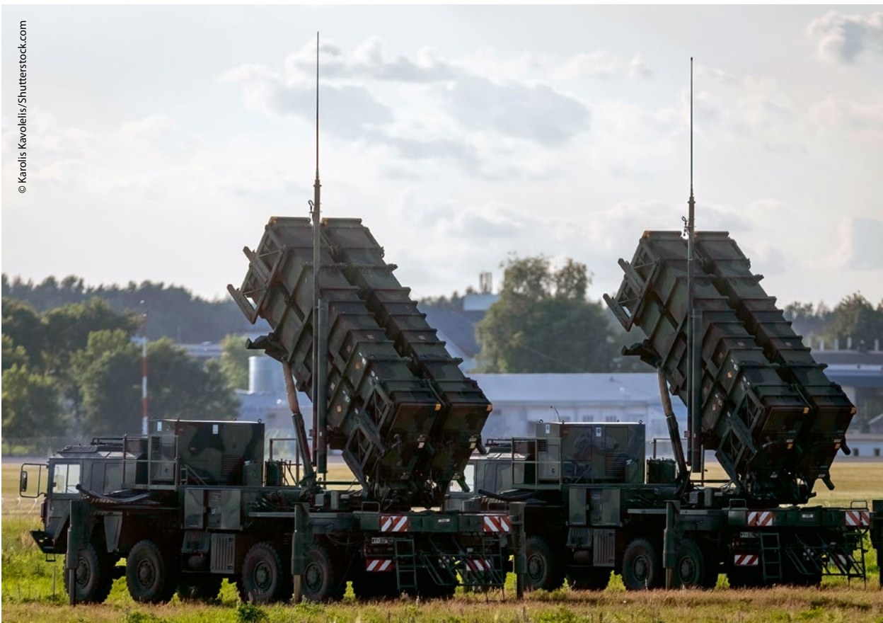
The MIM-104 Patriot Surface-Based Air Defence (SBAD) system is capable of engaging manned and unmanned aircraft, cruise missiles, and tactical ballistic missiles.

can play for the weaker side in a conflict. Ukraine's ability to strike Russian military targets hundreds of kilometres inside Russian territory with relatively primitive drones is a game changer with respect to shaping a future aggressor's willingness to go to war. 15 As drone technologies mature, rather than relying on 'first person view' aerial drones equipped with small explosives, which are playing an important role on the battlefield in Ukraine today, it is probable that a near future battlefield will see AI-enabled drones roam the battlefield looking for pre-programmed targets. No longer will they need a pilot in a nearby bunker flying them. Drone swarms may be used for large-scale attacks against military facilities or civilian infrastructure as well. 16 Drones may also take the place of expensive manned aircraft, which potentially benefits Russia more than NATO because Russia cannot match NATO traditional